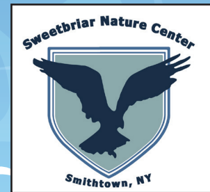
Sweetbriar Nature Center Presents: Exploring Our Planet Thursday, July 27 • 6:00-7:00pm