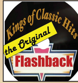
Flashback Saturday, July 15 • 5:30-7:00pm