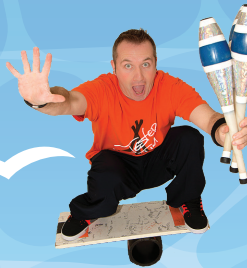
Jester Jim Wednesday, July 19 6:00-7:00pm