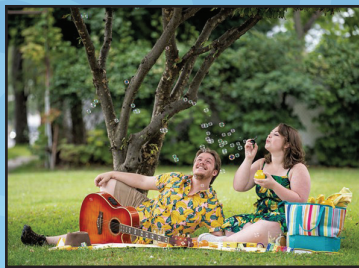
The BenAnna Band Wednesday, July 12 2:00-3:00pm