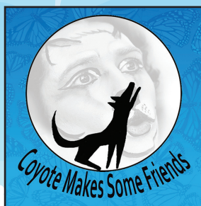
StoryFaces Show: Coyote Makes Some Friends Wednesday, August 2 6:00-7:00pm