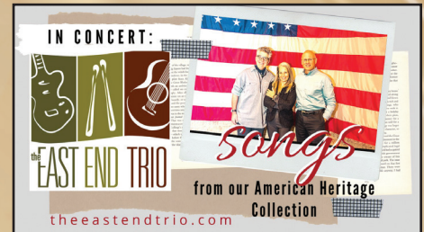
East End Trio Friday, September 15 • 5:30-6:30pm