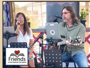
The Lighter Side Saturday, September 9 5:30-7:00pm