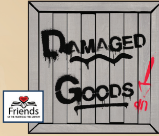
Damaged Goods Saturday, July 8 • 5:30-7:00pm