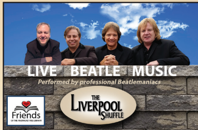
Liverpool Shuffle Saturday, August 19 • 5:30-7:00pm